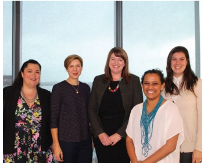
Deloitte and SBC Social Impact project presenters at the License to innovate – breakthrough strategies for social impact breakfast event.

The proposed childcare model is currently restricted by government policy and legislation so continues to be a focus of discussion between the Ministries of Social Development and Education. In its absence, a Flexible Childcare Assistance package was made available to parents in the project, which aimed to support their childcare needs and remove this barrier to their employment.