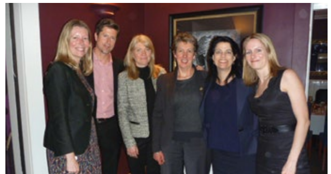
SBC Sustainable Leadership Governance Group

With the increasing focus on sustainability by New Zealand business, we wanted to ask the question 'Why would businesses continue to have a focus on sustainable business practices?' A group of senior SBC members has been working with SBC to capture the changing business case for sustainability. The work draws on the latest international thinking and the experiences of a number of our leading business leaders here in New Zealand. They provided insights about how they are thinking and talking about sustainability, where they are seeing the value turn up, and identified some of the drivers behind the shift towards more sustainable business practices. You can see the Business Case for Sustainability at www.sbc.org.nz/resources